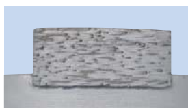
High diamond concentration