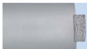
High quality steel barrel