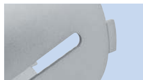
High quality slotted steel barrel